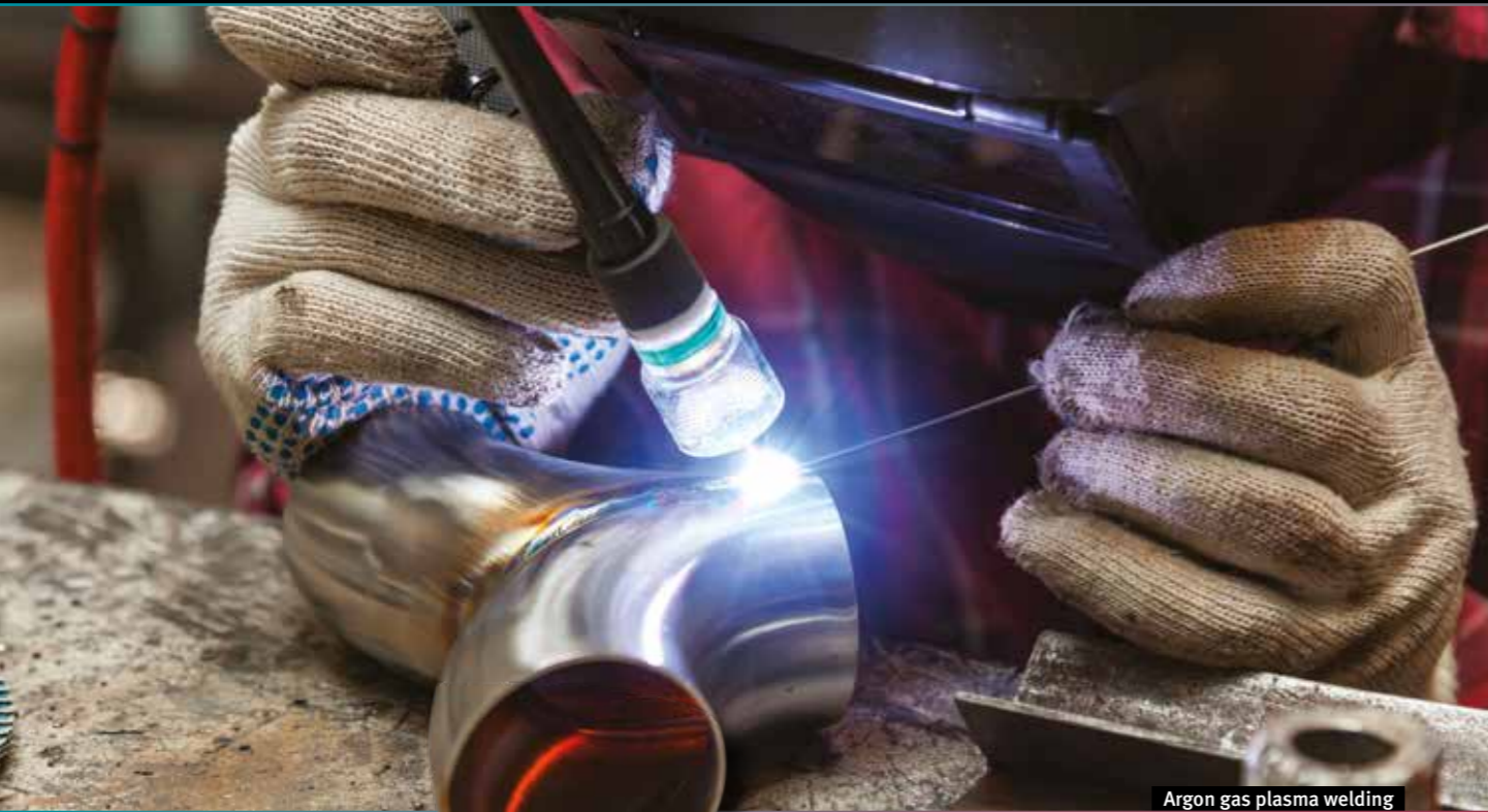
Argon gas plasma welding