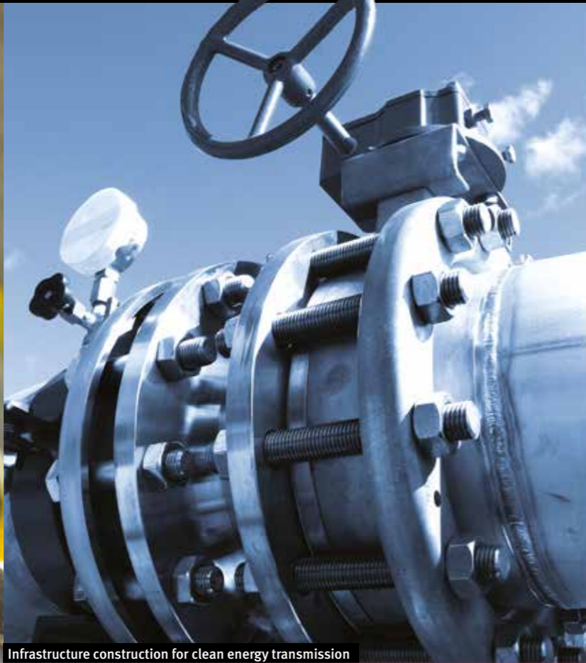
Infrastructure construction for clean energy transmission

of modern engineering and process control fundamentals. It builds on best practices used in adjacent energy processing sectors.”