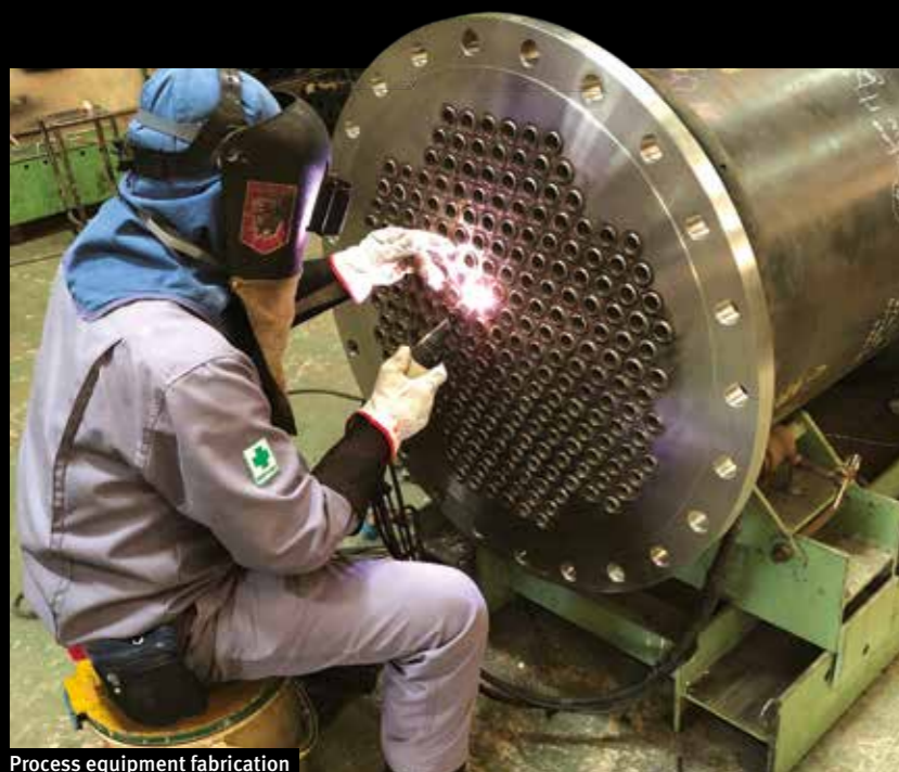
Process equipment fabrication

gas or biomethane and mains water to generate hydrogen.” To drive the reaction kinetics in the reformer, heat energy must be applied at a high temperature. This is achieved by burning some of the natural gas to heat the catalysts inside the reactor tubes.