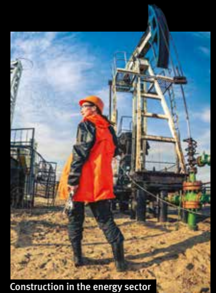
Construction in the energy sector

Achievement of a very high vacuum on the ammonia suction of the compressor is the key innovation that Cool Science has built into its process to enable temperatures that previous embodiments of the technology have been unable to deliver. Van Den Elzen adds that, “a technology that is more than a century old has been turbo-charged through the implementation ▶