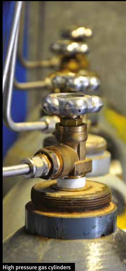
High pressure gas cylinders