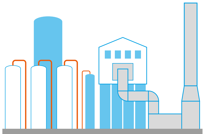
Steam Methane Reformer