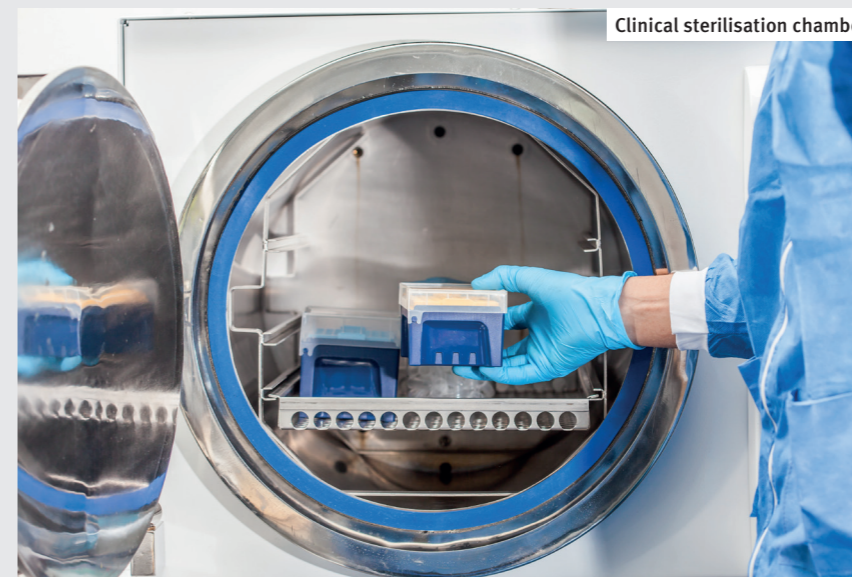
Clinical sterilisation chamber