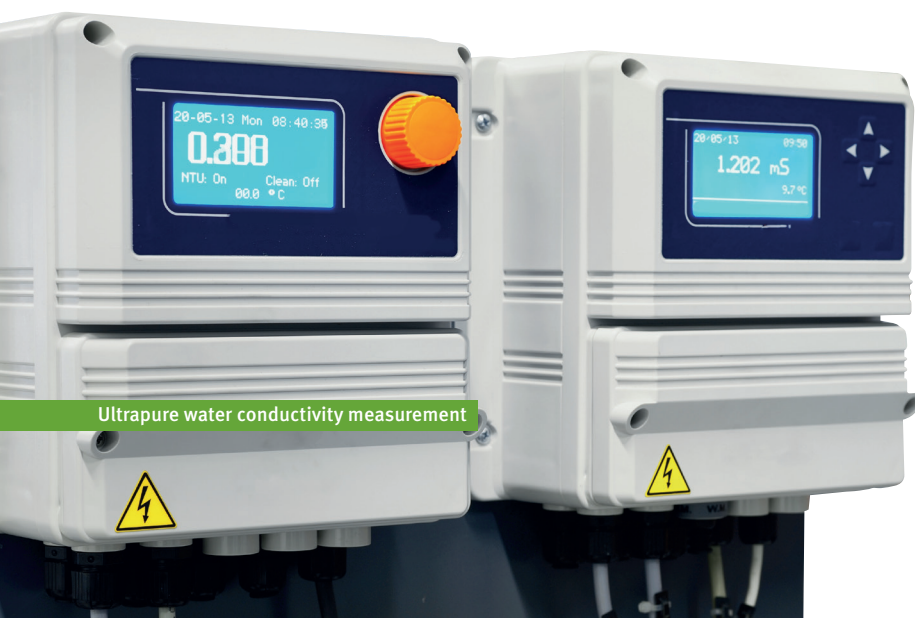
Ultrapure water conductivity measurement

Electrolysers are expensive capital assets and represent the largest portion of the investment for green hydrogen or green ammonia projects. Protecting the core of the investment with high quality, reliable ultrapure water equipment will undoubtedly be a sound business decision. gw