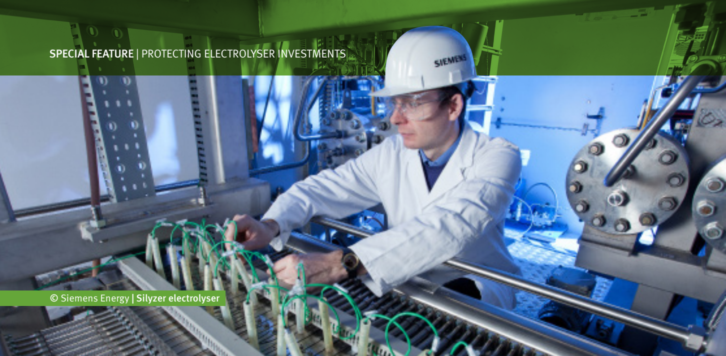
Silyzer electrolyser

► for an electrolyser would be Grade 2 with a maximum conductivity of less than 2\mu\text{S}/\text{cm} ( 0.2\text{ mS}/\text{m} ) as the target. They may also offer the required water purification equipment as part of a complete package to ensure ultrapure water is generated according to their requirements.