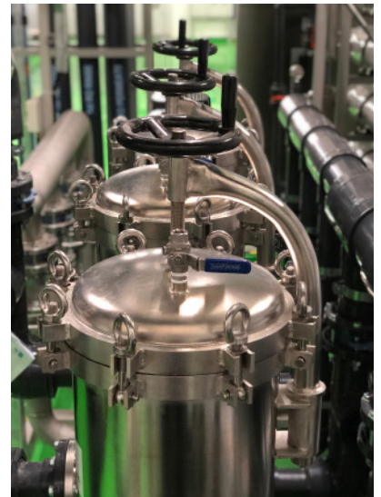
Activated carbon for removal of chlorine and organic molecules

The capital costs of ultrapure water production are generally between 4