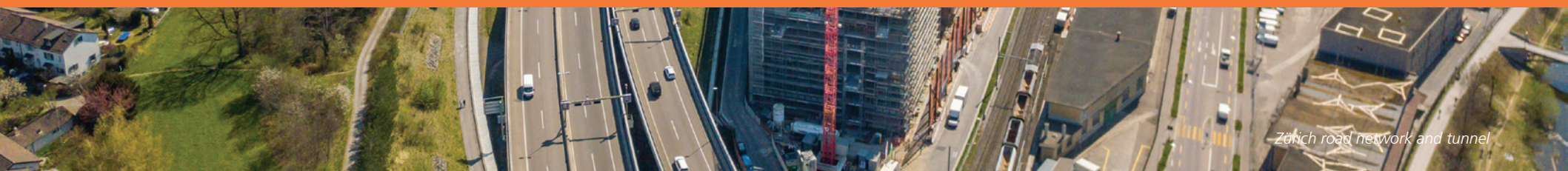
Zürich road network and tunnel