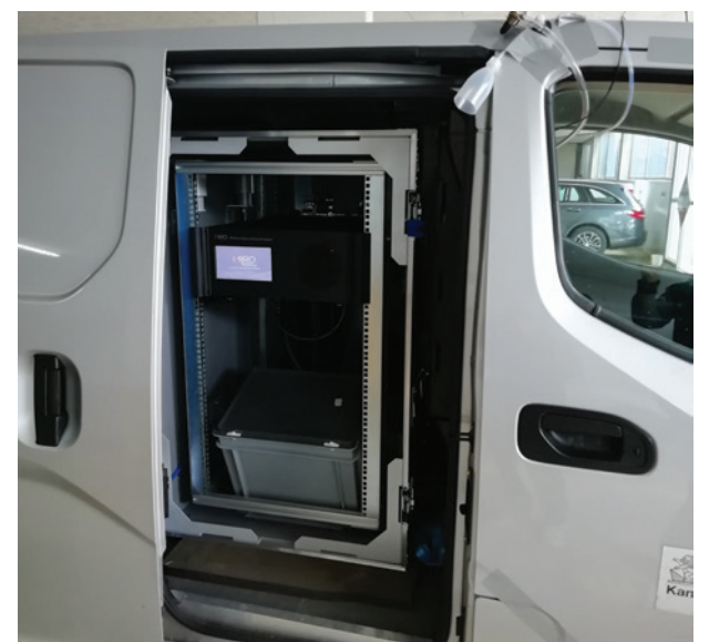
MIRO QCL gas analyser used for the Gubrist Tunnel test