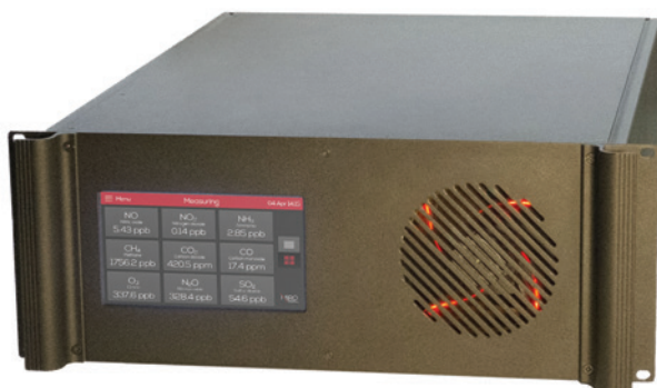
10 component QCL gas analyzer