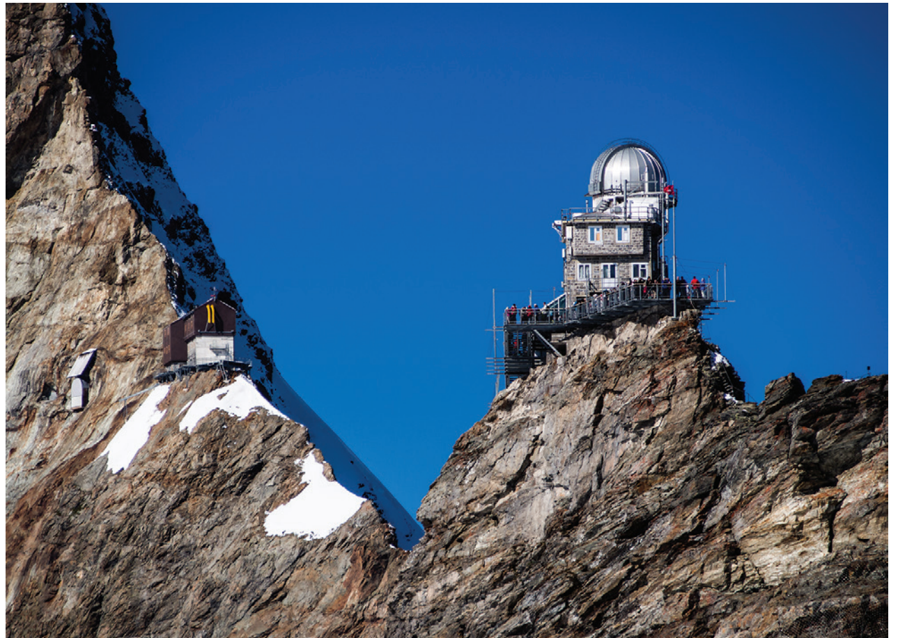
Sphinx observatory, Jungfrauoch, Switzerland

One of the MIRO devices is installed in the legendary Sphinx observatory located on a rocky peak in the Swiss Alps on the Jungfrauoch, just south of the Eiger, 3,571m above sea level. Its role is to measure minute traces of NO 2 in the atmosphere accurately. These provide boundary conditions for sophisticated air quality simulations which will help scientists model atmospheric chemistry more reliably.