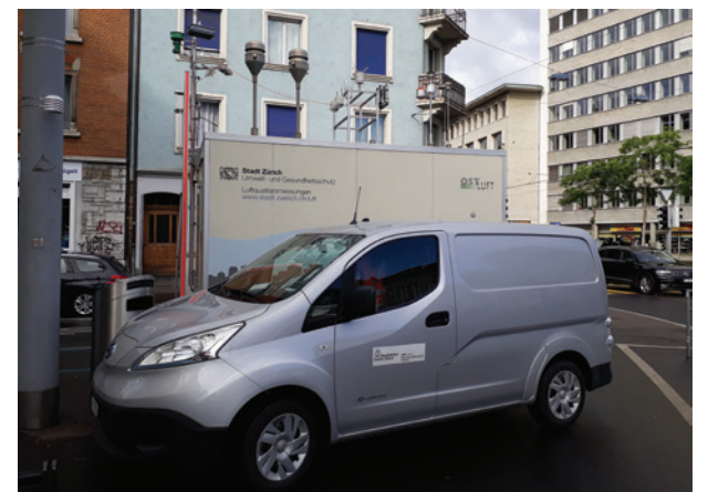
test vehicle fitted with the MIRO QCL gas analyser

In a recent study, conducted by AWEL of the Canton of Zürich, the MIRO QCL gas analyser was used to simultaneously monitor 10 gases inside the Gubrist Tunnel in Zürich. Smaller cars with petrol engines and heavier diesel cars and trucks use the 3.5 km long tunnel continuously. From east to west, there is a 70 m incline in the tunnel. As the test vehicle drove through the tunnel in both directions, data from the test showed conclusively how pollutant and greenhouse gas emissions such as NO, N 2 O, NO 2 , NH 3 , CO 2 , CH 4 , and CO levels all spiked during the high-load upward haul and were lower on the downhill run.