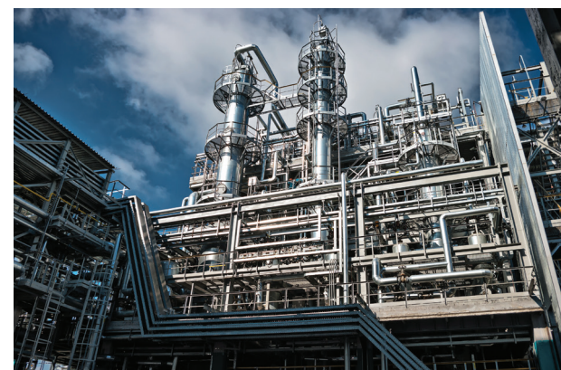
Acetylene is used to produce synthetic rubber

Microwave plasma energy was also used by Atlantic Hydrogen in their turquoise hydrogen pilot plant in Eastern Canada. Today,