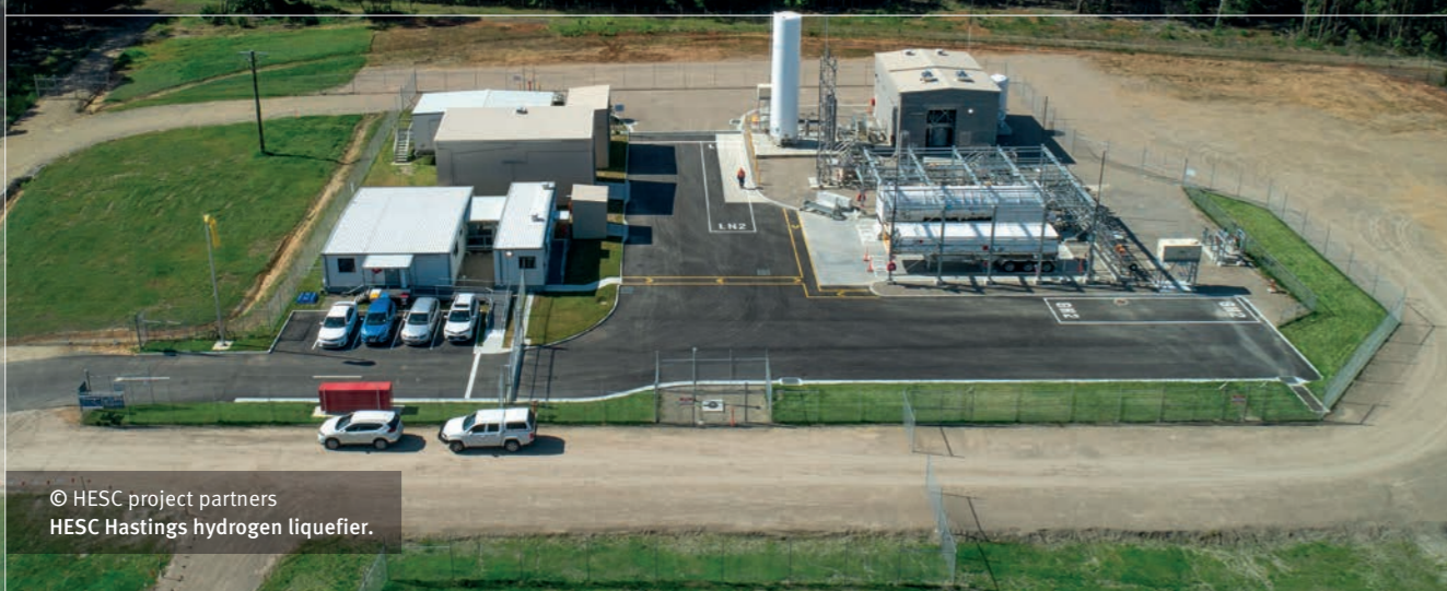
HESC Hastings hydrogen liquefier.