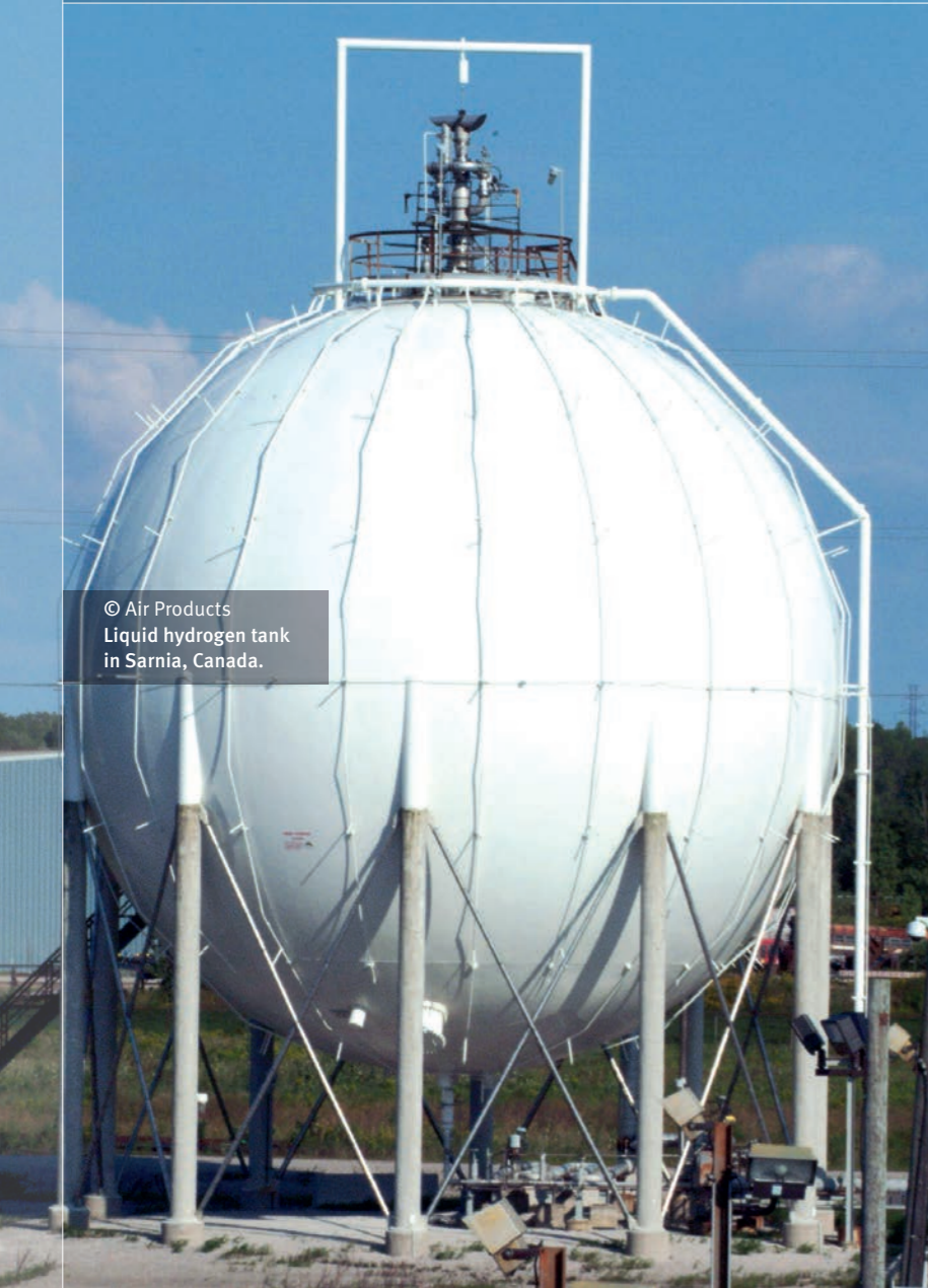
Liquid hydrogen tank in Sarnia, Canada.