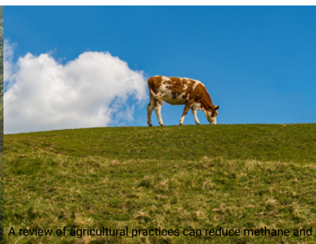
A review of agricultural practices can reduce methane and nitrous oxide emissions