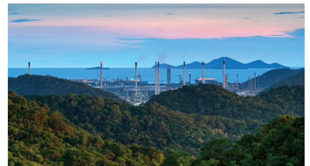
Refineries are often located close to sensitive natural resources such as rivers and oceans