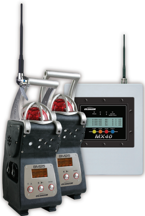
BM25_and MX40

Entry into confined spaces presents an additional risk due to reduced ventilation and the potential for hazardous gas accumulation. Kevin O'Donnell says that "wearing a portable gas detector as part of their PPE is routine for many maintenance teams on refinery wastewater treatment plants. One of the benefits of our PS200 is that it can be configured to include an internal sample pump. That means that gas can be drawn from up to 30 metres away using flexible tubing. This eliminates the need to lower the detector into a pit or empty tank prior to entry and it's a much better way to monitor the atmosphere inside the tank". If the tank has been purged with nitrogen, it will be essential to ventilate the tank with air prior to entry. The PS200 can validate that a safe oxygen concentration has been achieved in the tank to avoid asphyxiation of the maintenance team.