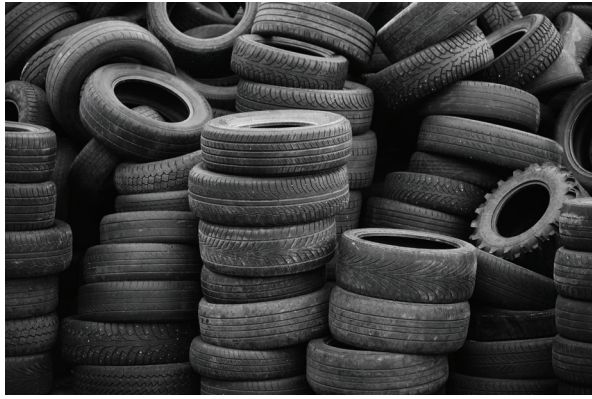
Refuse derived fuel - tyres

alternative, selective catalytic reduction (SCR) is more costly and would be complex to implement in cement making. However, SCR may be required in the future to achieve lower NOx emissions levels as regulations tighten. But, at present, SNCR is adequate for regulatory compliance in most jurisdictions.