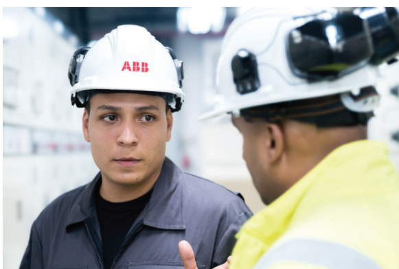
Gas analysis service

Steel and cement are essential for construction of modern infrastructure. Roads, bridges, tunnels, tower blocks and waterworks - they all rely on these durable building materials. Concrete, which is made from cement, sand and aggregate is the world's most abundant man-made substance.