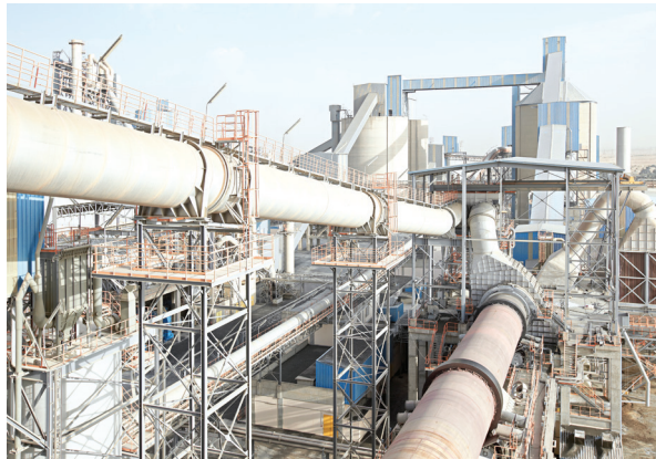
Cement making kiln

A further stage of flue gas polishing is conducted using activated carbon. VOCs and mercury are removed.