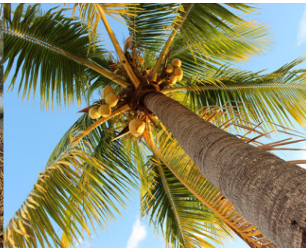
Coconut husks and palm fronds can be converted to bi