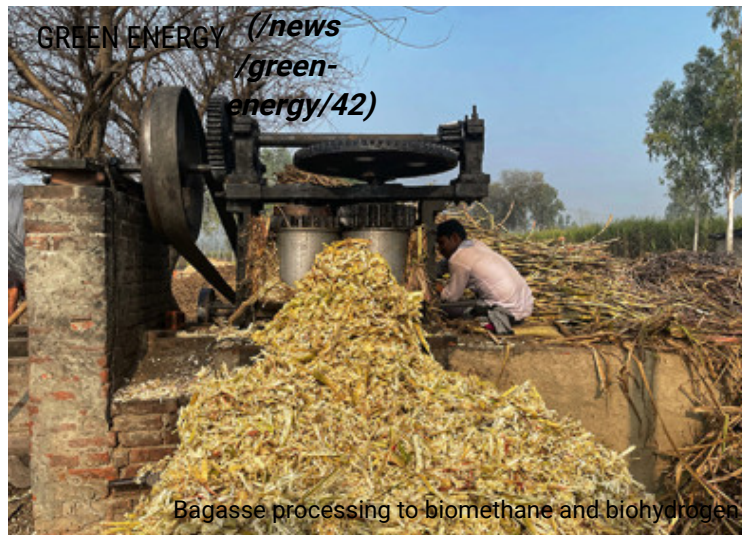
Bagasse processing to biomethane and biohydrogen