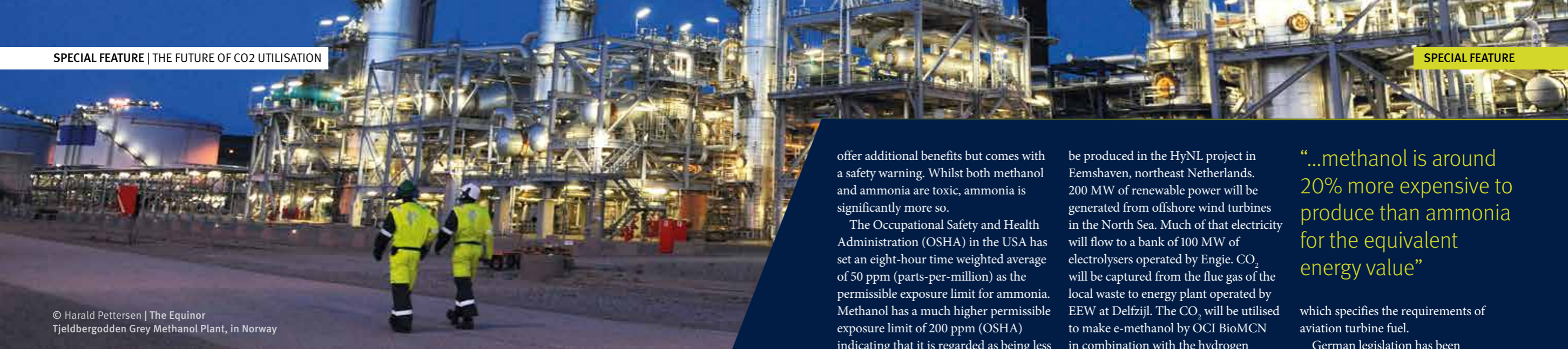
The Equinor Tjeldbergodden Grey Methanol Plant, in Norway