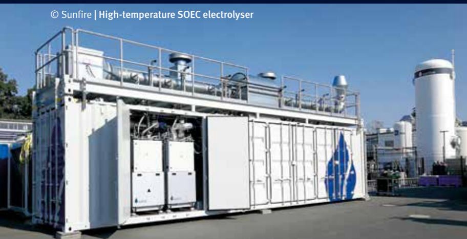
High-temperature SOEC electrolyser