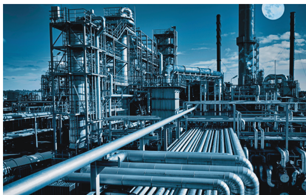
Figure 1. Both global automotive emissions legislation and the drive for energy sustainability are having an impact on refinery end products.

Today there are three main global legislation groups related to automotive emissions coming out of Europe, the USA and Japan.