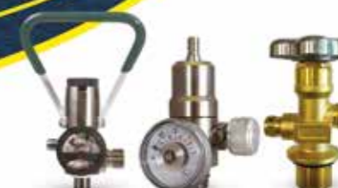
Medical Specialty Industrial