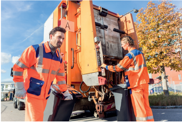
MSW has a high biogenic fraction