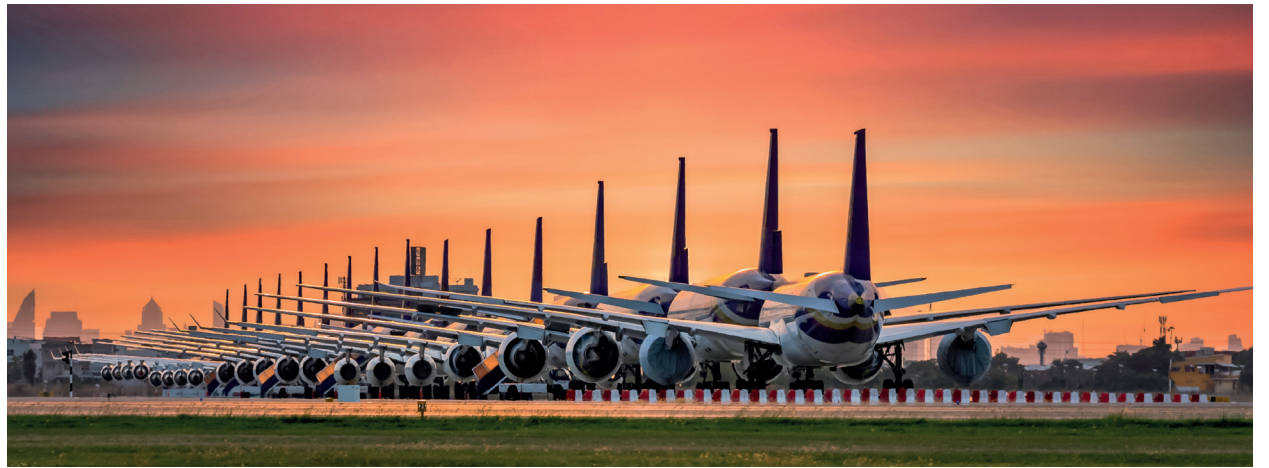
Air water and renewable power for e-fuels and e-fertilizers

The EU regulation related to the production of renewable fuels of non-biological origin (RFNBOs), such as sustainable aviation fuel (SAF), prohibits the use of fossil carbon dioxide (CO 2 ) captured from power generation after 2036. In 2042, the production of RFNBOs using CO 2 captured from so-called ‘unavoidable’ industries, such as cement making, must be phased out.