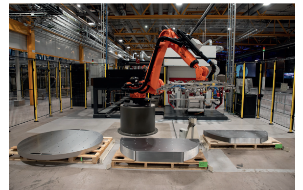
Nel alkaline electrolyser production

Through the analytical technique of radiocarbon dating, the proportion of biogenic and fossil CO 2 can precisely be measured. This will be essential to ensure that the WtE plant operator pays the correct fee for their CO 2 emissions and will simultaneously enable accurate assessment of the biogenic fraction of CO 2 that is captured from the WtE plant flue gas.