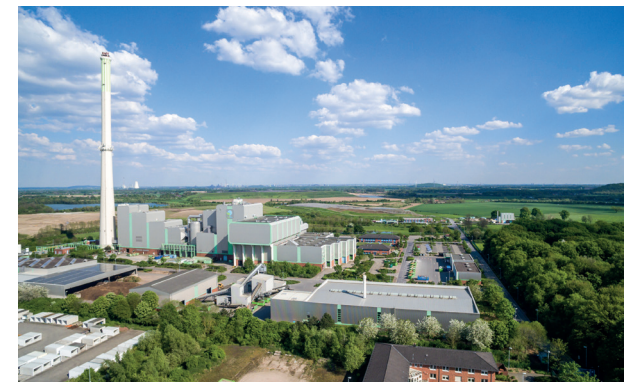
Kamp Lintfort Waste to Power plant, Germany

Bio-energy CO 2 capture and utilisation or storage has generally been linked to the combustion of wood chips to generate power. In 2022, Drax Power Station in the UK, which can generate up to 2.5 GW, emitted 12 million tonnes of CO 2 , making it the UK's largest single emitter of CO 2 in the power sector. This CO 2 is regarded as climate neutral since it was drawn out of the air by the trees.