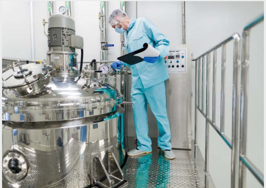
Biotechnology, algae, and bio-based solutions can also be applied to yield energy efficient methods of carbon capture.

The US-based company LanzaTech utilises an anaerobic acetobacter bacterium in a gas fermentation reaction to convert CO-rich feed gases