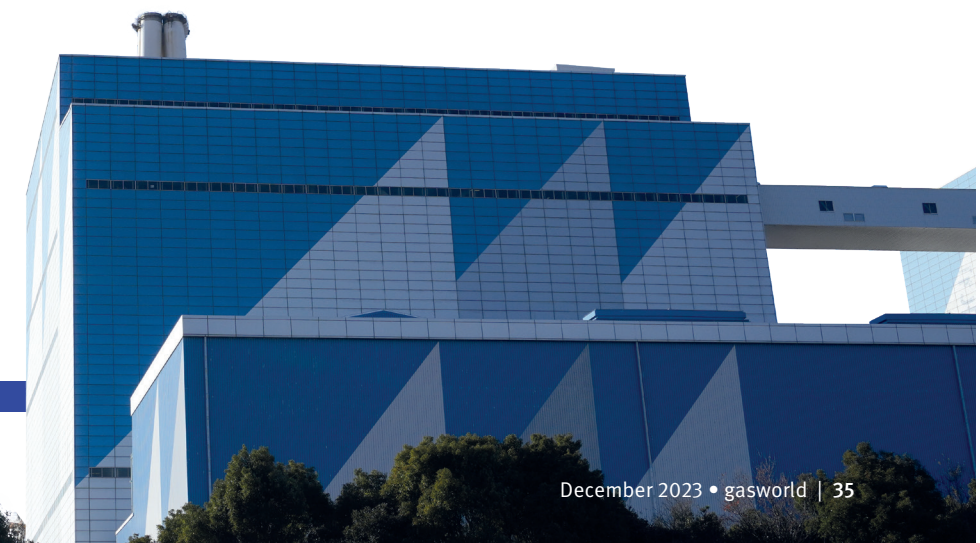
Hekinan coal-fired power plant, Japan

Green hydrogen and green ammonia projects in this decade have yet to catch up with the scale of operations from the past century. The first GW-scale green ammonia scheme to start up, in NEOM in the Kingdom of Saudi Arabia (KSA), has been pioneered by Air Products. Electrolysers will convert water to hydrogen, which will be reacted with nitrogen from ASUs supplied by Air Products to produce ammonia. ▶