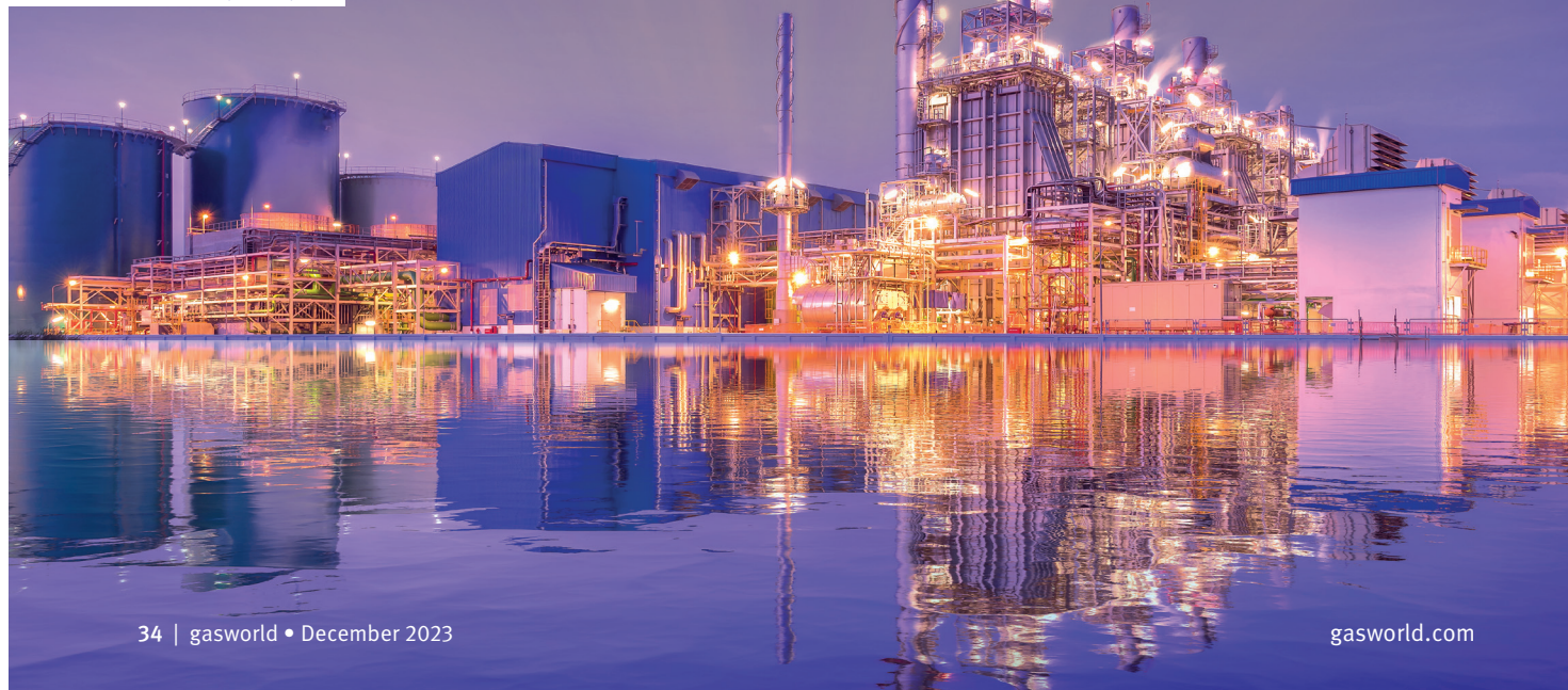
Gas-fired power plant

And, since ammonia is of interest as a clean energy vector in support of decarbonisation, it must be produced in a low-carbon way using new technologies. Ammonia's time has come, and the industrial gases sector has the expertise to support the next wave of ammonia growth.